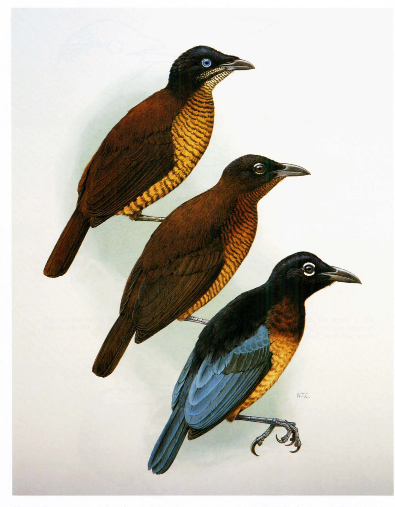
Plate 1. The appearance of the unique Australian Museum specimen AM O. 40100 female-plumaged Parotia lawesii × Paradisaea rudolphi hybrid, or Schodde's Bird of Paradise, (centre) and that of the putative parent taxa AM O. 38564 female Parotia lawesii (exhibita) lawesii (top) and AM O. 40078 immature male Paradisaea rudolphi margaritae (bottom). Painting by William T. Cooper.