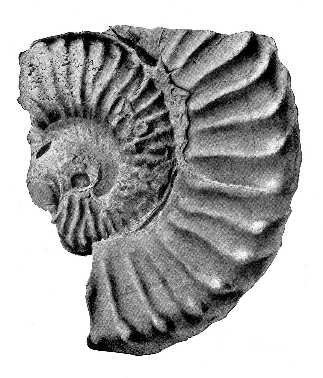
Hy. KING, photo. Sydney.