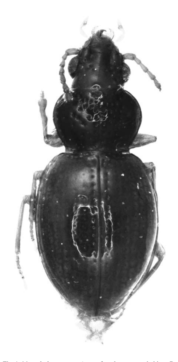
Fig. 1. Mecyclothorax moorei n.sp., female paratype, habitus. Body length: 3.25 mm.

Colour. Rusty red, centre of head, pronotum, and disk of elytra darker, piceous to almost blackish, but dark colouration of elytra very ill delimited. Suture, base, and margins of elytra reddish, antennae reddish, mouth parts and legs dirty yellow. Lower surface of head, prothorax, and middle of abdomen piceous, rest reddish.