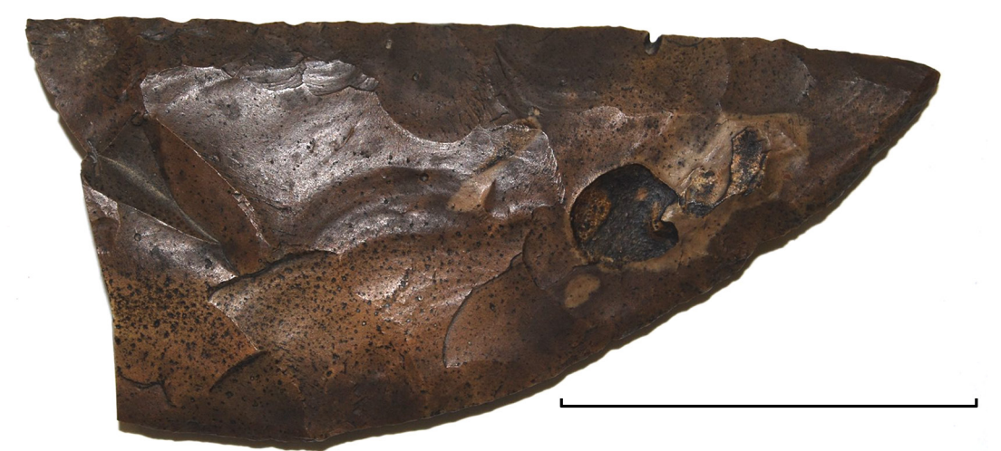
Figure 8. Knife-fragment, AM E9639, 9.5 cm long, 44 g. Scale 5 cm.