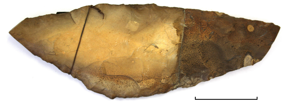
Figure 4. Preform of a knife, AM E9616, 21.5 cm long, 332 g. Scale 5 cm.