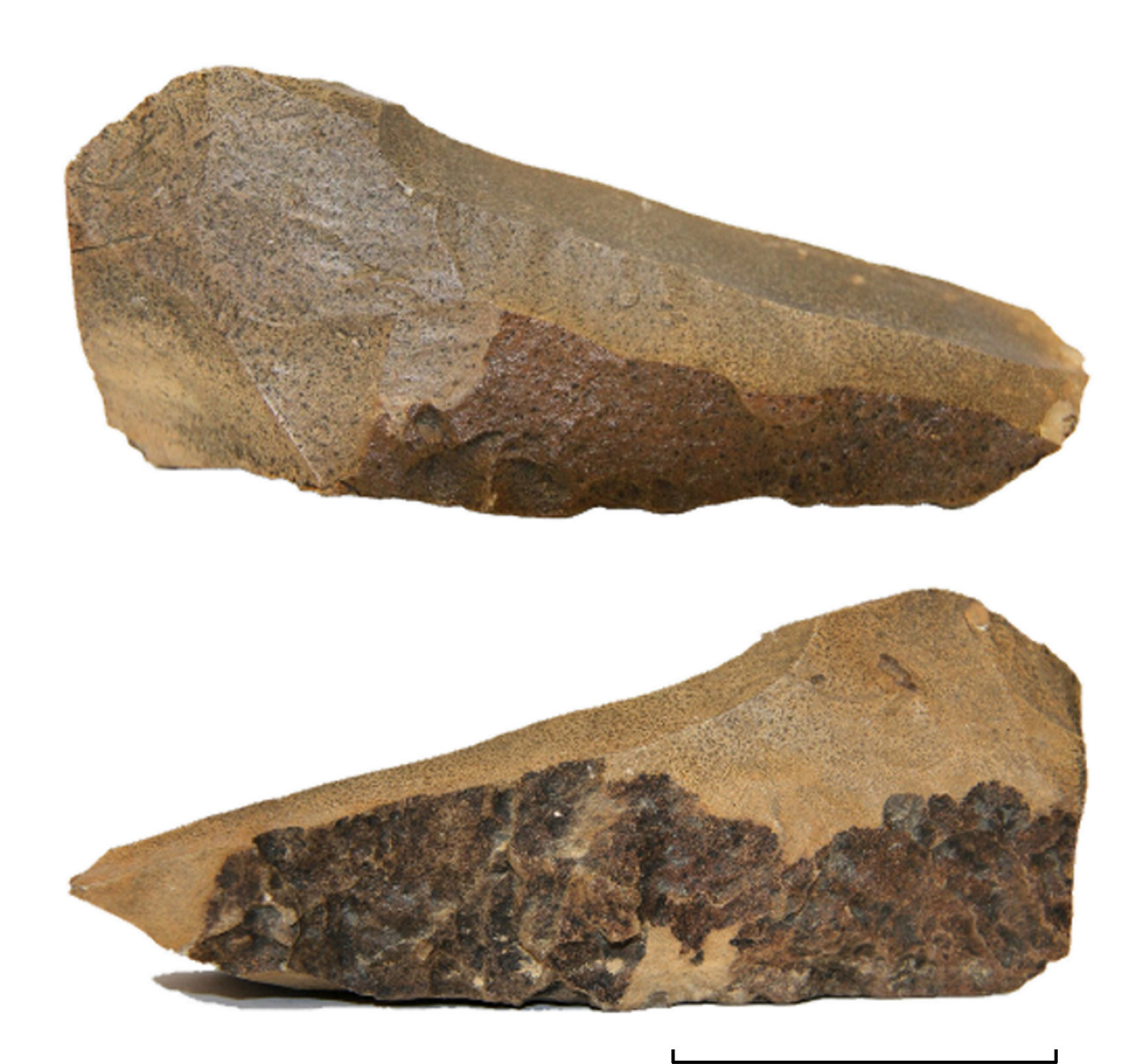
Figure 17. Hoe, AM E9660, 13 cm long, 250 g. Scale 5 cm.