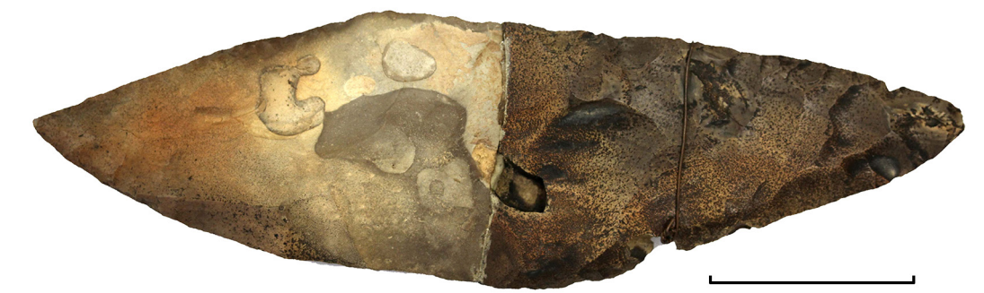
Figure 5. Knife, AM E9681, 23 cm long, 222 g. Scale 5 cm.