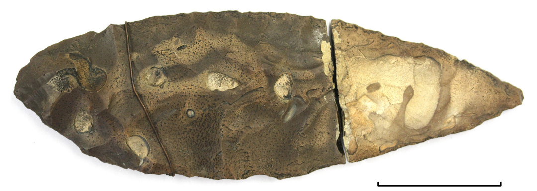
Figure 3. Knife, AM E9617, 19 cm long, 170 g. Scale 5 cm.