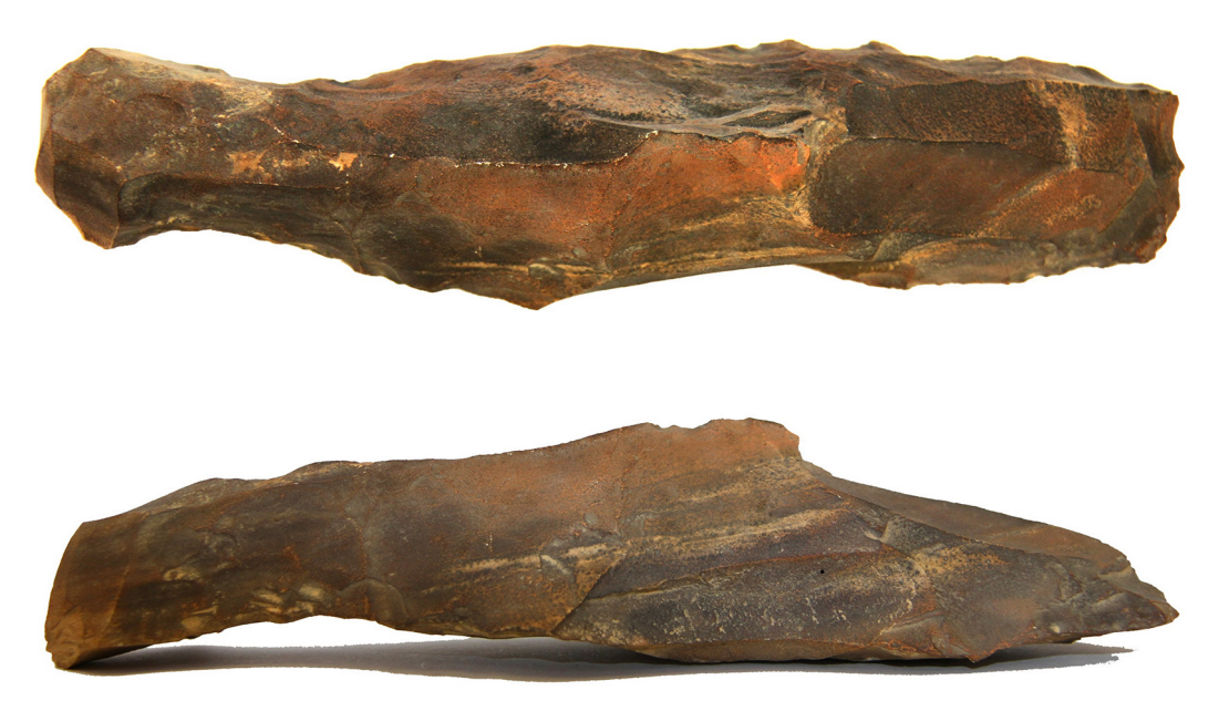
Figure 15. Pick, AM E9653, 21 cm long, 482 g. Scale 5 cm.