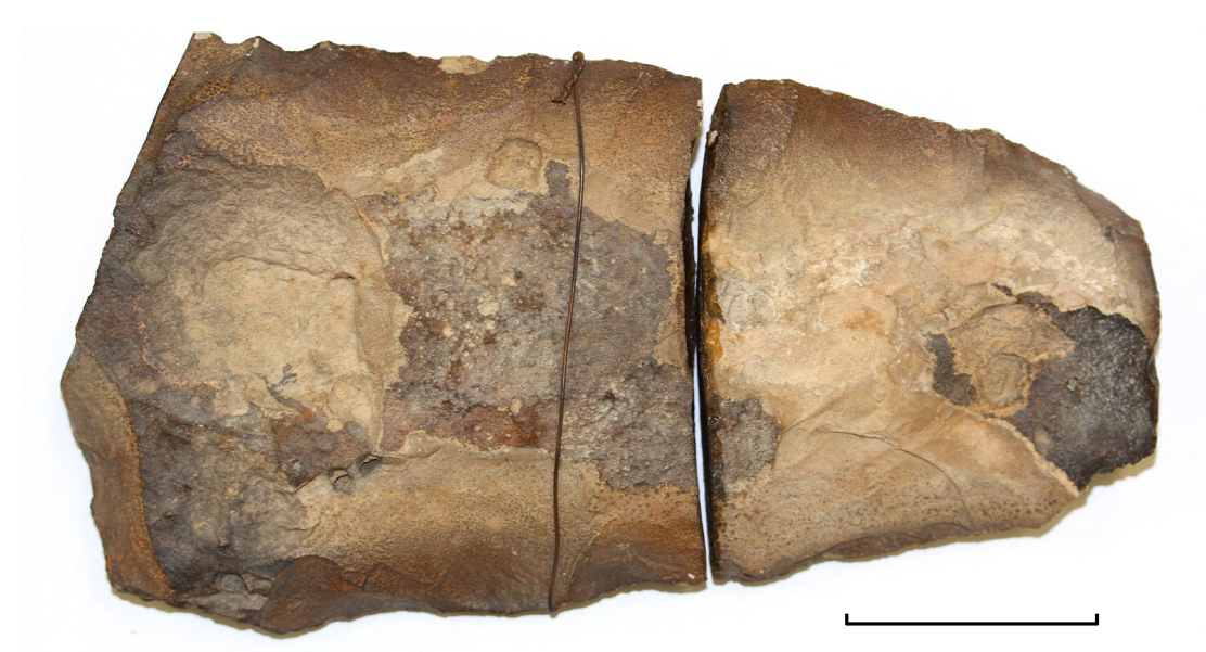
Figure 2. Preform of a cleaver, AM E9582, 20 cm long, 658 g. Scale 5 cm.