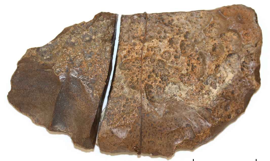
Figure 9. Preform of crescent knife, AM E9581, 17 cm long, 330 g. Scale 5 cm.