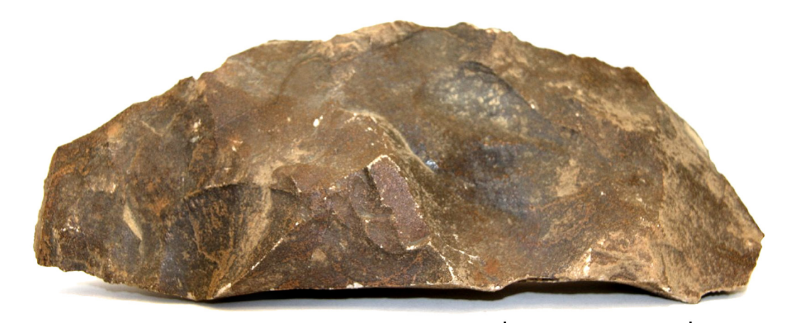
Figure 14. Preform of a pick with crest, AM E9661, 21 cm long, 848 g. Scale 5 cm.