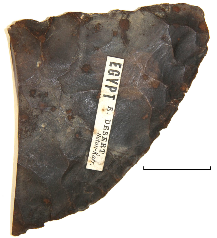
Figure 11. Fragment of crescent knife, AM E9666, 15.5 cm long, 190 g. Scale 5 cm.