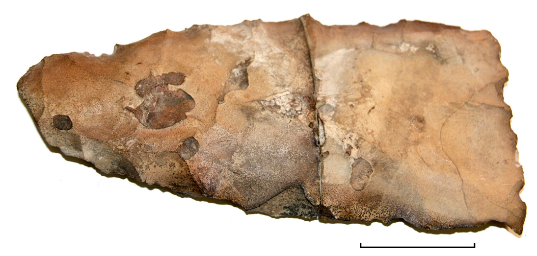
Figure 13. Advanced preform of a cleaver, AM E9602, 23.5 cm long, 722 g. Scale 5 cm.