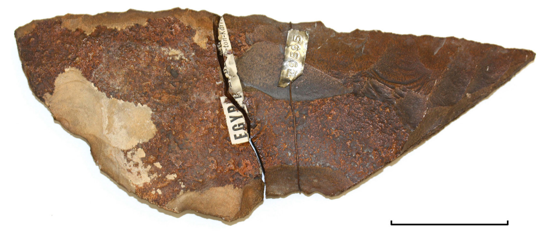
Figure 6. Preform of a knife, AM E9595, 24 cm long, 450 g. Scale 5 cm.