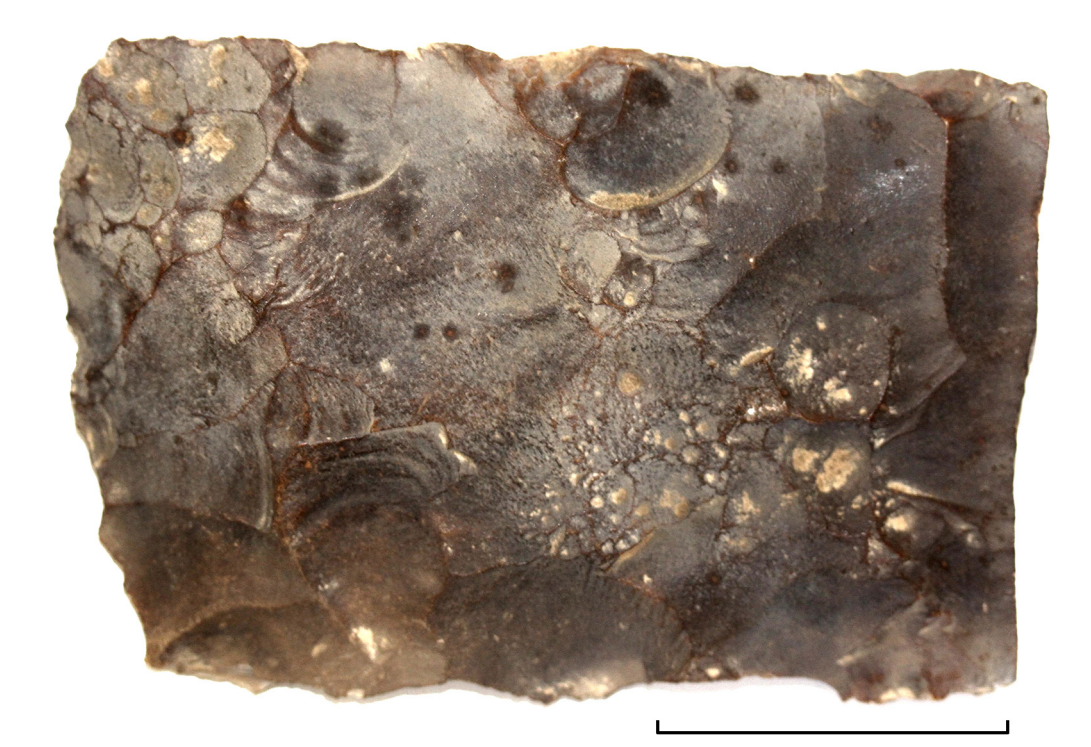
Figure 12. Fragment of a cleaver, AM E9692, 13 cm long, 344 g. Scale 5 cm.