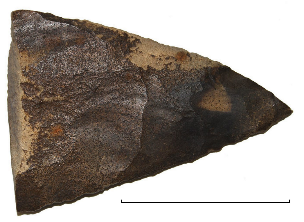
Figure 7. Knife-fragment, AM E9637, 8.5 cm long, 34 g. Scale 5 cm.