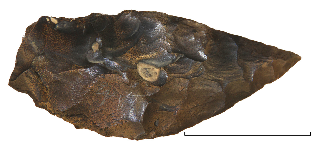
Figure 10. Fragment of a short knife, AM E9627, 12.5 cm long, 82 g. Scale 5 cm.